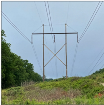
Existing structure to be replaced