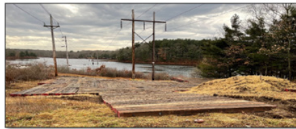
Timber mats "matting"