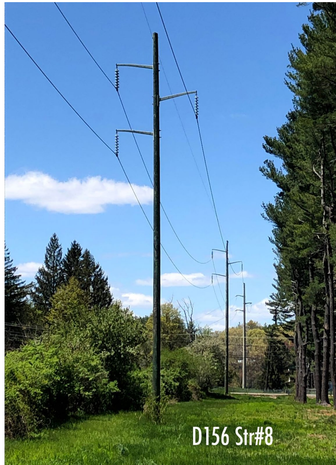
Typical D156 wood pole structure