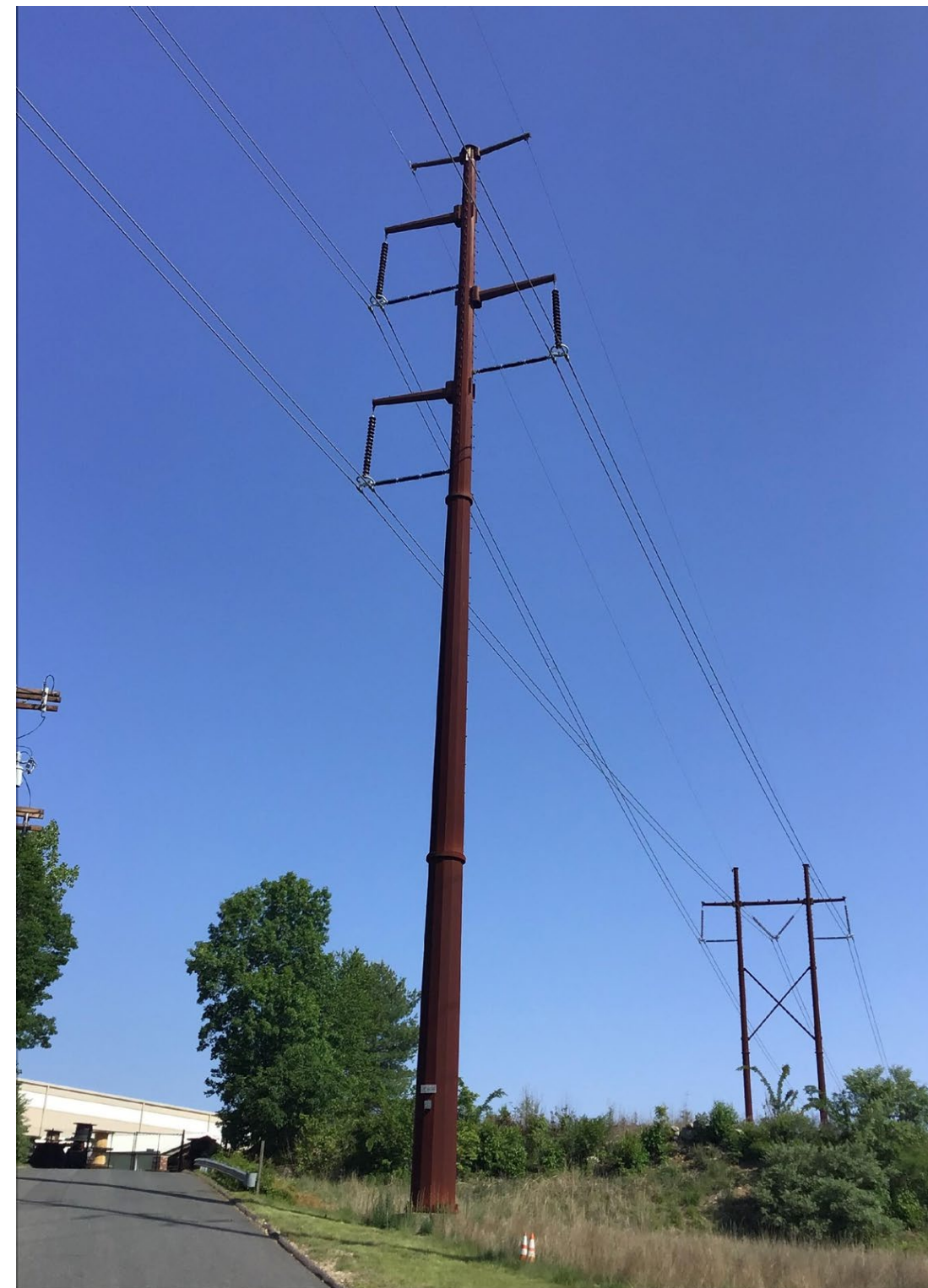
Example weathered steel structure

Most structures being replaced will increase in height between 5 ft. and 20+ ft.