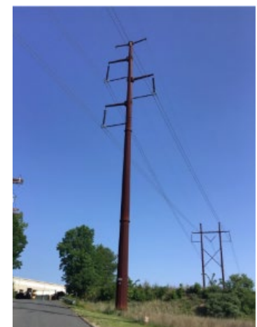
Example of a weathered Steel structure